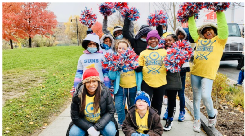
Annual Toledo Blade Holiday Parade 2021